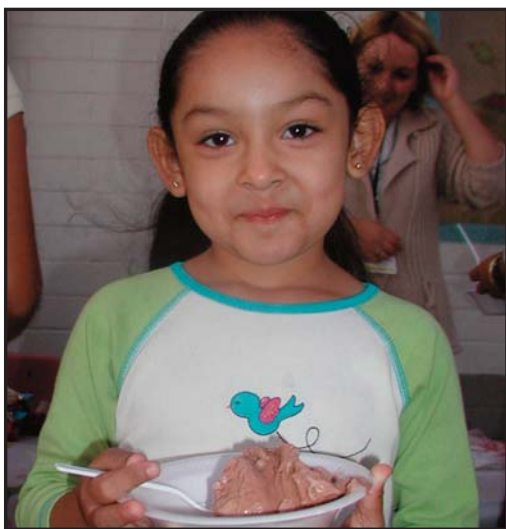
A Stepping Stone child enjoys her ice cream at the Ice Cream Social at Westwood on October 16th.