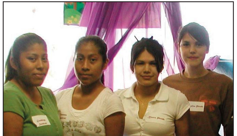
Former preschoolers who are now in high school attended the Stepping Into College event in September.