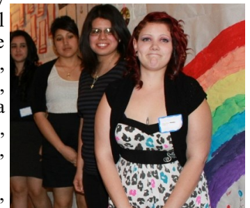
2011 Billie Gannaway Scholars wait to claim their awards.