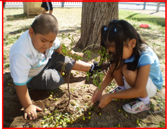
Preschoolers Learn About Nature