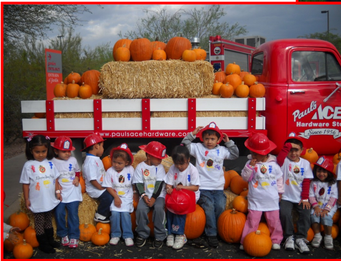
The children at Fowler rode a hay wagon for a visit to the pumpkin patch