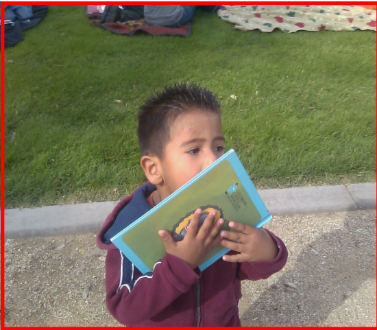
Enjoying a book at the park