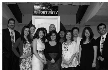
Last year's scholarship winners and guests.

We hope you will join us in celebrating the Stepping Stone kids and their families as they prepare to pursue higher education. Call for tickets at: 602-843-8281.