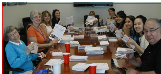
Left, volunteers preparing newsletter. Right, home visit with family.