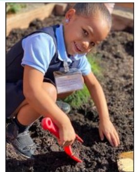
A LEAF preschooler planting seeds at Bret Tarver Isaac site.

The past school year saw us scrambling to learn how best to deliver our program through distance learning (DL). In August of 2020, we held our enrollment to ten families per site with the hope of returning in person within a few months. Ten is a manageable number for physical distancing and other COVID protocols. Unfortunately, we spent the entire 2020-2021 school year online with our children and families. Fortunately, and to our great surprise, most students still met all their Teaching Strategies Gold benchmarks and were ready to begin Kindergarten! The beginning of this 2021-2022 school year is all about bringing our children back into the classroom in as safe and as meaningful a way as possible. Both sites have children back in-person! There are more details about this in our website blog. Please take a look there.